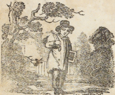
The good boy going to school.